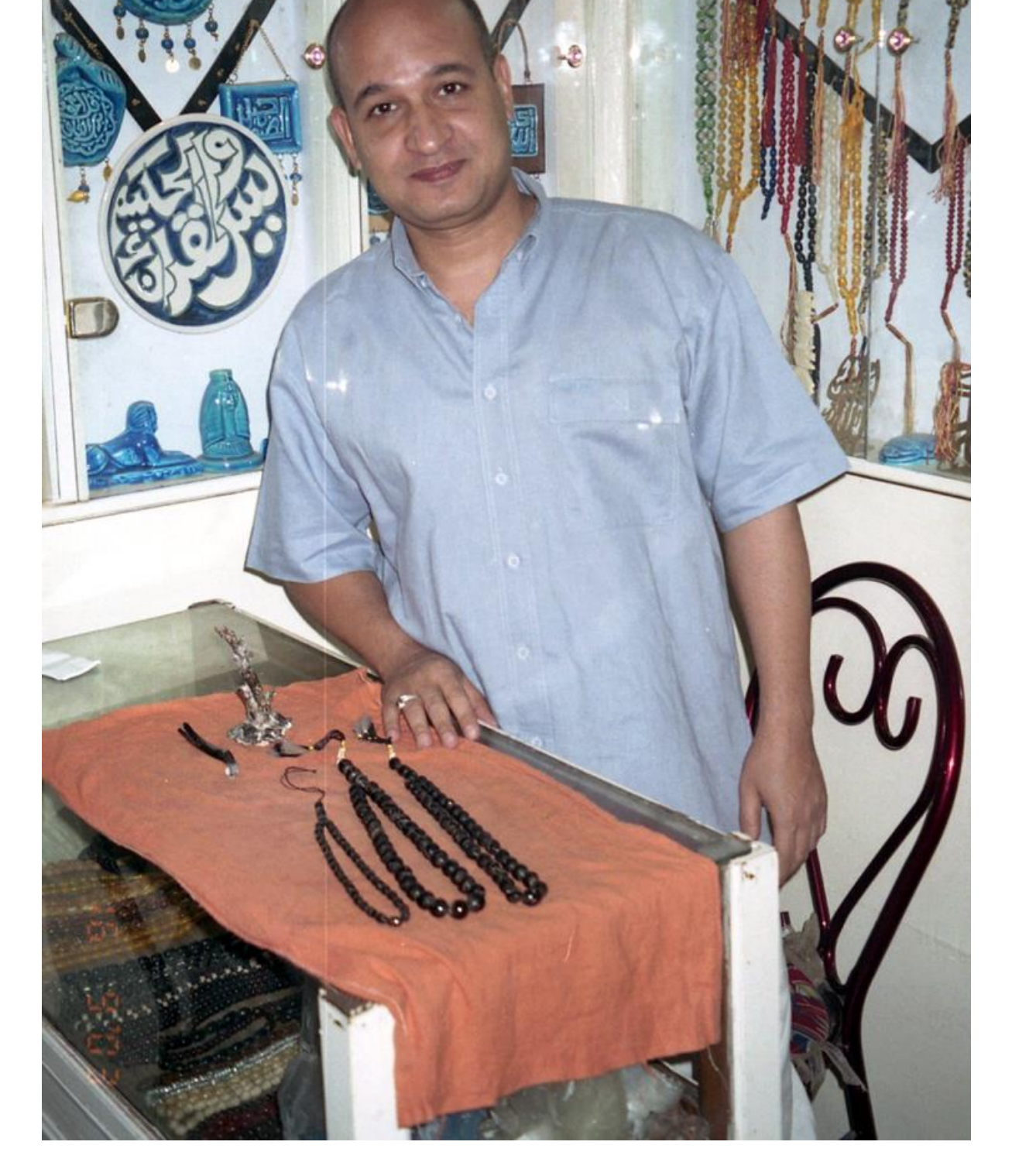
Fig. 2 Muslim rosary store owner [photograph taken in Khān al-Khalīlī, Cairo on 16th September 2003, by the author]