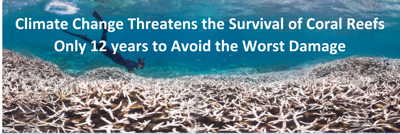
Bleaching coral reef in American Samoa, 2015

Coral reefs are structures created by coral animals and are among the most biologically diverse ecosystems on the planet. They provide goods and services worth at least US$11.9 trillion per year and support (through such activities as fisheries and tourism) at least 500 million people worldwide. Potent anti-cancer drugs have been derived from coral reef organisms, and others are in testing; healthy coral reefs could save millions of lives.